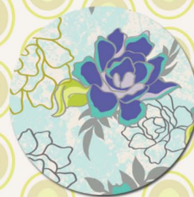
MA-4308 Blue Rose Garden