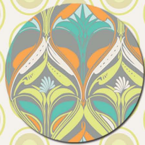
MA-4407 Peach Calla Lilly