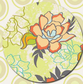
MA-4408 Mint Rose Garden