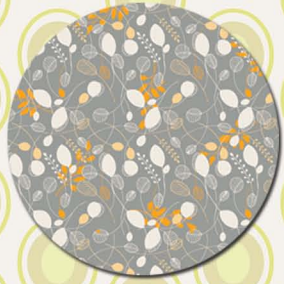
MA-4401 Dim Fusion