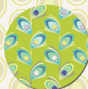
MA-4305 Green Peacock Eye