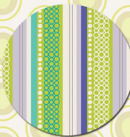
MA-4303 Cucumber Organic Stripes