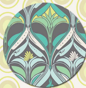
MA-4307 Lemon Calla Lilly