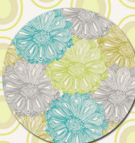
MA-4306 Teal Flower Blast