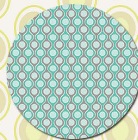
MA-4302 Turquoise Fizz