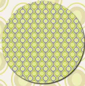
MA-4402 Olive Fizz