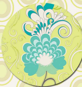
MA-4309 Lime Flirty Dance

The Serene palette is all about explosive turquoises combined with soft greys that bring a sophisticated, eclectic mix.