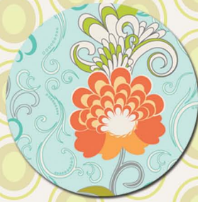
MA-4409 Citrus Flirty Dance