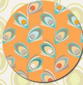
MA-4405 Orange Peacock Eye