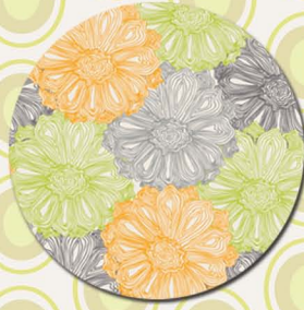
MA-4406 Mango Flower Blast