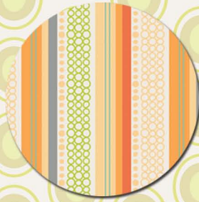
MA-4403 Papaya Organic Stripes