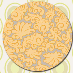
MA-4404 Apricot Royale