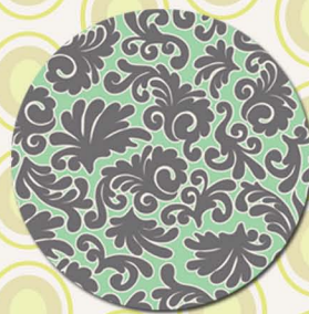
MA-4303 Sea Foam Royale